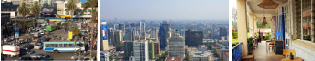
Image Allison Jennings. (2018). Crime in Kenya: What to look out for. World Nomads . Retrieved from https://www.worldnomads.com/travel-safety/africa/kenya/the-realities-of-kenya-crime ; Images© Clementine Logan. (2018). How to live like a local in Nairobi. Lonely Planet . Retrieved from https://www.lonelyplanet.com/kenya/nairobi/travel-tips-and-articles/how-to-live-like-a-local-in-nairobi/40625c8c-8a11-5710-a052-1479d276ab8b

Modern Attendant's role shifts in accordance to travelers' needs. They are depicted as street performers, shopkeepers, drivers, guides, chefs, bartenders, repairmen, host families, dance instructors, needy for saving (see Needy ), spectacles (see Exotic Consumed ) and knowledgeable experts eager to explain the behaviors of exotic animals.