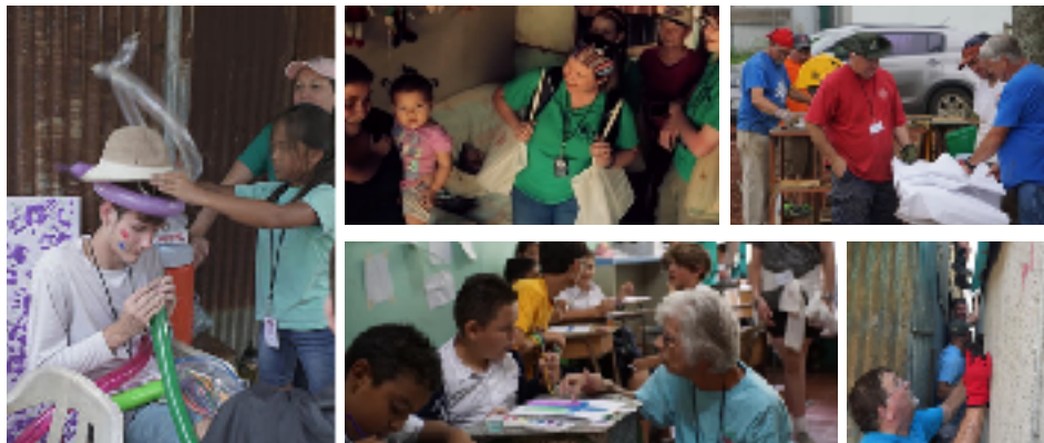
Images from @puravidamissions. (2018, February 28). Retrieved from https://www.instagram.com/p/BfvKsqFHlyj/ ; Rice & Beans Ministries. Retrieved from https://www.rabmin.org/ministries

Images of the Savior position Westerners as magical heroes within missions marketing. They arrive with bags of food, bouquets of balloons and boxes of face paint. They give piggy-back rides, play games, build structures and repair floors, leaving hordes of smiling children in their wake.