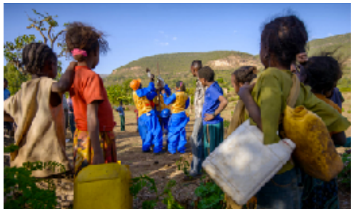
Images from (2019, January 28). East Africa hunger, famine: Facts, FAQs, and how to help. World Vision . Retrieved from https://www.worldvision.org/hunger-news-stories/east-africa-hunger-famine-facts ; Heather Klinger. (2019, February 15). Matthew 25: Pray for the thirsty. World Vision . Retrieved from https://www.worldvision.org/clean-water-news-stories/pray-thirsty-clean-water .